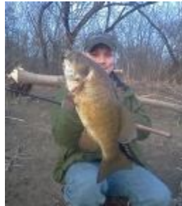
French Creek fishes great in March and April for variety of fish.