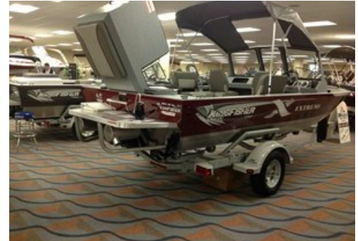
Boat of the Month: