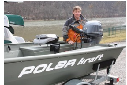
Happy new owner of a river jet