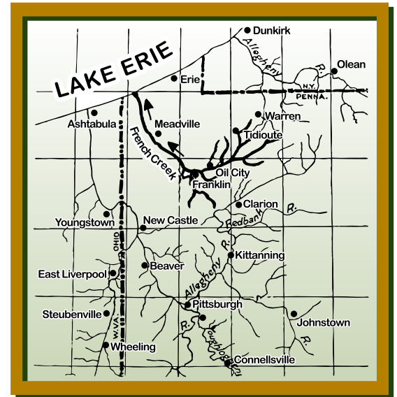
Figure 1: Pre-glacial drainage of the upper Ohio drainage system showing the northward path of French Creek.

During this ancient time, French Creek began near the mouth of the current Clarion River, was much larger in size, and flowed Northward past present day Franklin and Meadville. (See Figure 1) Just past Meadville, it connected with Conneaut Lake and moved onto the Lake Erie Basin and into Lake Ontario. From Lake Ontario, drainage flowed into the St. Lawrence River and then into the Atlantic Ocean.