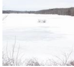
Wilhelm not safe/db