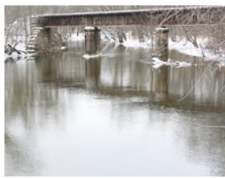
Shenango River @ Jamestown/ db

Editor's note: Looking for open water to fish? While checking NW PA lakes for safe ice on the 11<sup>th</sup>, I discovered that sections the Shenango River were running warmer than French Creek or Allegheny River – the result of warmer water coming out of Pymatuning Lake and Shenango River Lake. Both French and the Allegheny had edge ice with slush and chuck ice floating downstream.