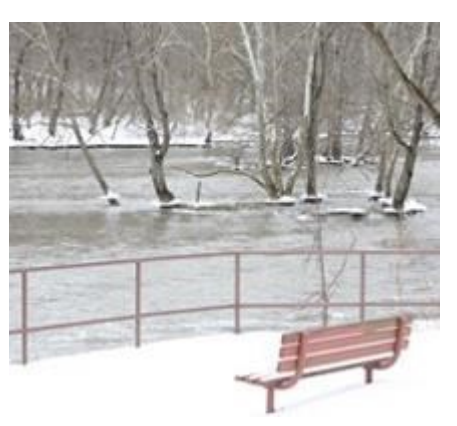
Shenango River @ Sharpsville/ db

Editor's note: Looking for open water to fish? While checking NW PA lakes for safe ice on the 11<sup>th</sup>, I discovered that sections the Shenango River were running warmer than French Creek or Allegheny River – the result of warmer water coming out of Pymatuning Lake and Shenango River Lake. Both French and the Allegheny had edge ice with slush and chuck ice floating downstream.