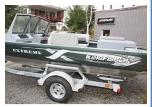
Boat of the Month: Kingfisher Extreme Shallow inboard—ideal Allegheny cruising boat

There's still a couple months of fishing remaining in 2013. Wiegel Brothers Marine has these three boats in stock and ready to fish.