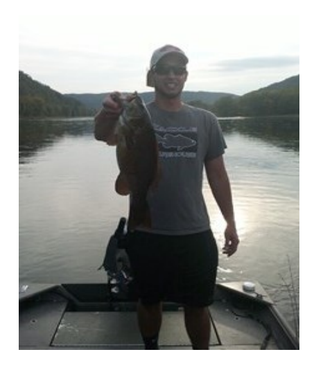
River SMB