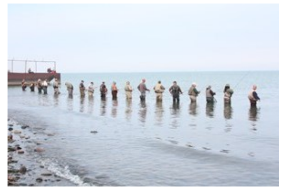
Steelheaders wading at mouth of Trout Run

Ed Lawrence (Corry) filed 10/7: "I had a chance to do some steelhead fishing. The fish are close to the mouths of the streams. I had luck with live bait. Fish were hitting worms, maggots, flies and shiners. I caught two nice females last week that were each 23 inches and 5 pounds. Hope to see more fish when water levels rise." (See Livewell)