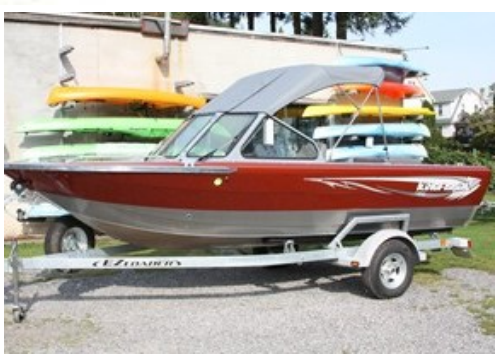
Still almost 3 months of river fishing left this year; check with Wiegel for available boats.