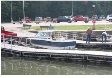
Perch anglers out of Walnut

Mike (Trout Run Bait) filed 10/7: "Mad house here this Monday morning with phone ringing about stream forecasts. Streams going up enough to have fish move upstream, but water level and color will not hold. We need at least 3 inches of rain in watershed to sustain flow. Catching steelhead will be tough by Wednesday once again. But out in the lake, guys are catching jumbo perch in 25' to 30'—when the wind isn't blowing."