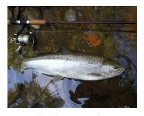
23" steelhead