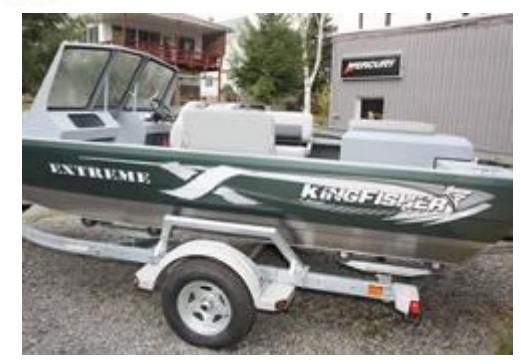
Boat of the Month: Wiegel Marine has one new Extreme Shallow and a lightly used Rogue still available for this winter season on the river!