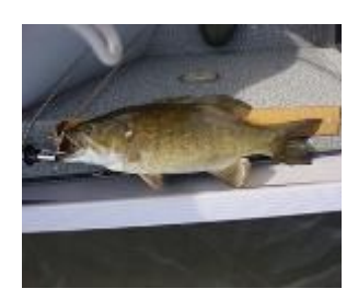
21-1/2 inch SMB