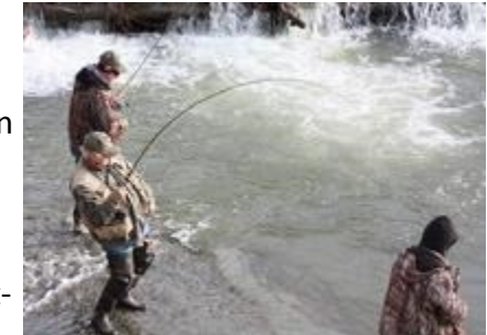
Steelhead Action!