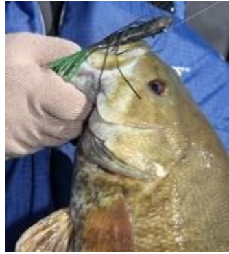
Get Bit Crawling Tube/DB

with 30 smallmouth up to 19 inches and 6 walleyes from 18 to 21 inches. I was using VMC #4 Circle Hooks on 10-pound Berkley Fireline with a leader...not 100% hook-up on each hit, but close. However the best thrill was seeing my first pair of River Otters!"