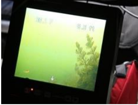
Under ice view with Marcum-DB Photo

Fergie's Bait (Lake Wilhelm): Mon-Fri 8 am to 4 pm; Sat/Sun 8 am to 3 pm