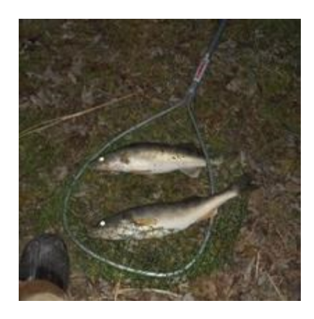
Angler Al's first walleye catch 2014