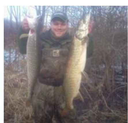
Musky and big pike back to back