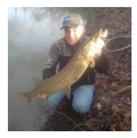
French Creek Musky on Gamma