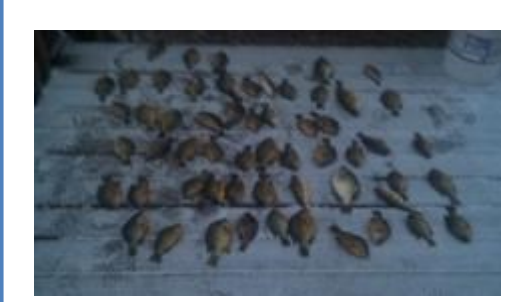
RJ's catch of panfish from PIB