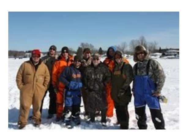
Boys from Pittsburg enjoyed minus 27 degrees