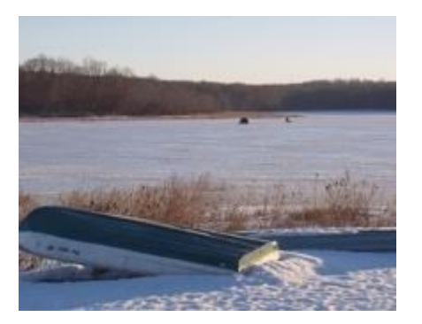
Kahle Lake