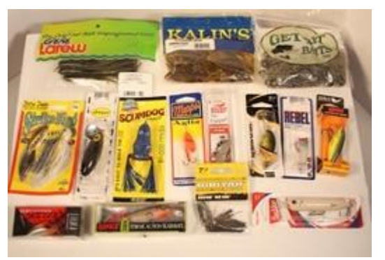
Bass Lure Pack Giveaway