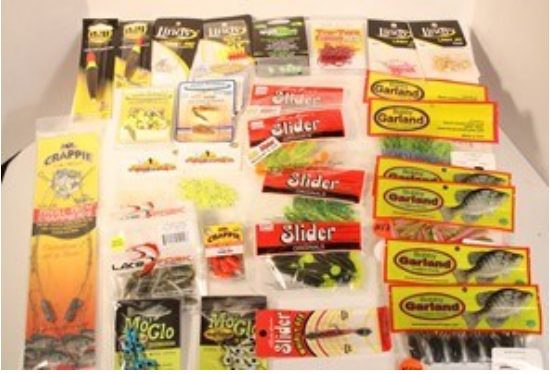
Crappie Lure Pack Giveaway