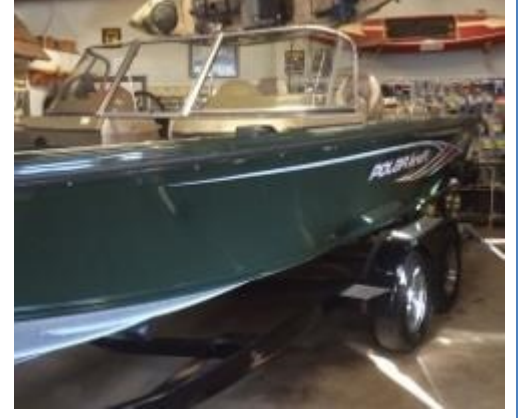
Boat of the Month: This versatile Polar Kraft will take you safely on Lake Erie fishing trips.