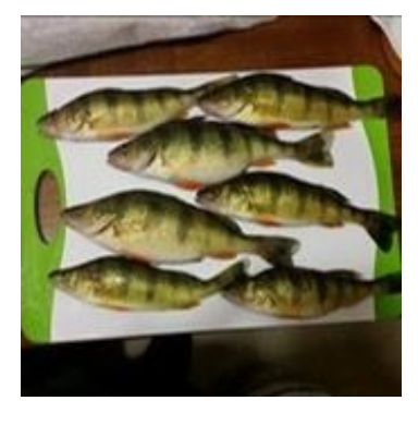
Dan Druschel's catch