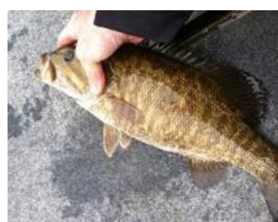
Pymatuning is turning on