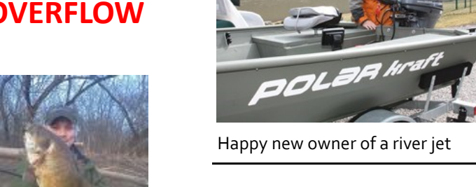
French Creek fishes great in March and April for variety of fish.