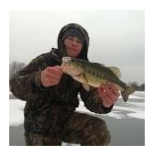
catches in Erie Tributaries were strong in March and continues into April.