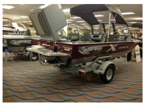
Boat of the Month: