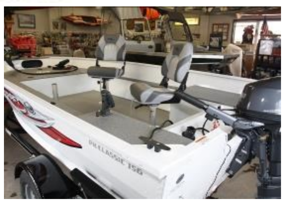
Boat of the Month: This PolarKraft Classic 156 is the perfect boat for crappie fishing at Pyme. This boat is in stock at Wiegel's Marine right now!