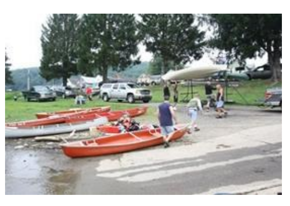
Franklin ramp busy with paddle sport people

Dale Black (Oil City) filed 7/29: "I've been sneaking off to the river several times the past week. Earlier in the week, I landed a 30 inch musky in the Oil City pool which tore up my hand. Fishing injured on Saturday morning near Fisherman's Cove, I still caught the bigger smallmouth while fishing with Darl Black. We expected a good day for big fish with the approaching storm, but got fooled, landing only about 8 bass in