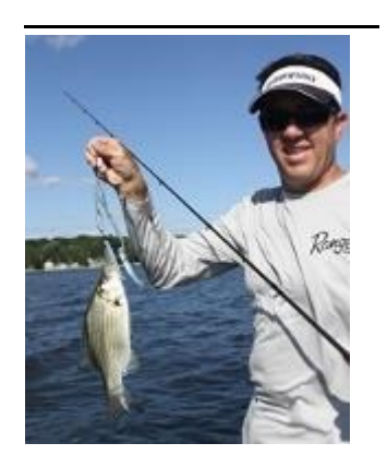
Umbrella rig white bass