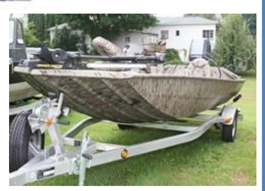
Boat of the Month: Express Bass XT 180 with 90/65 Yamaha Jet. Brand new offering.