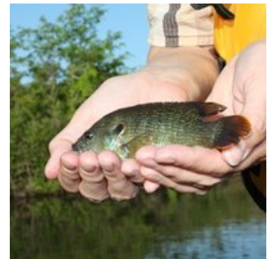
Sunfish species C: