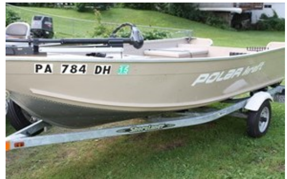
Check out Wiegel's used boats, too.