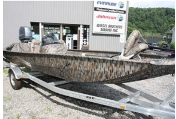
Boat of the Month: Debbie is declaring July as Express Jetboat month at Wiegel Brothers. Stop in to