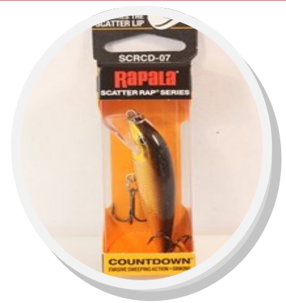
Scatter Rapala is hot for walleyes

Dave @ Richter's Bait ; filed 7/7: "Things at Pymatuning are in the summer patterns. Customers are still picking up a few walleyes, but you got to work for them. Catfish are being caught everywhere. There's been a lot more mention of largemouth bass being caught than in past years; bass are in the weeds. The Shenango River below the dam is giving up good crappies and walleyes due to the high water."