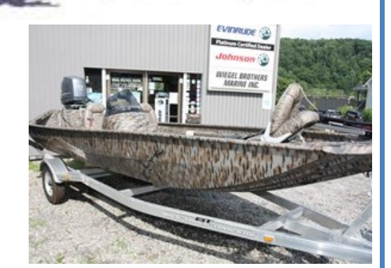
Boat of the Month: The Fall river bite is coming up. Get your jet boat today at Wiegel's!