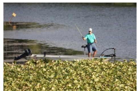
Fishing the "Stumps Area" (db photo)

Vicki @ Fergie's Bait; filed 8/15: "Lake Wilhelm fishing has been pretty good with cooler temperatures. I've had reports of 4 to 6 largemouths, as well as several walleyes between 7 and 8 pounds. Crappie hotspots have been around the main causeway, Launch #3 and #4, the shoreline along Creek Road; most catches are being made in the mid to late afternoon."