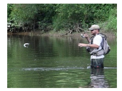
Smallies can jump (db)