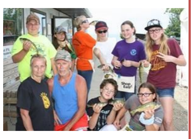
Hooked on Fishing crew at the Perch Tournament