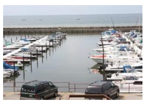
Northeast Marina

Tim @ North East Marina Tackle Shop; filed 8/4: "This past week the walleye fishing was Good Double Plus but not Excellent like it had been in previous weeks. The NE winds played havoc with the walleye bite, but guys were still getting decent number of good fish at 105 feet with 10 colors of leadcore out. Fish came on a mixed bag of plugs, spoons and worm harnesses. In the short water, the bite was also good for walleyes in 50 feet of water between the Ws and Shorewood with fish tight to the bottom. Perch were being taken at 52 to 53 feet west of Freeport. Walleye fishing looks very promising for the next several years as we