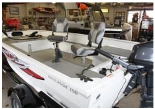
Boat of the Month: PolarKraft Classic - the perfect Pymatuning and Wilhelm 20 hp boat.