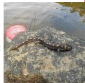
Angler Al photo

Angler AI (Franklin); filed 7/30: "After work on July 25<sup>th</sup> I found time to hit French Creek. I had in mind to use a couple black and yellow spotted salamanders I found. These fellas were 9 inches long. Upon entry to the water, they like to dive, so I rigged one of them on a big floating jighead. Much to my surprise, on my first drift with the bait, a huge 19" smallmouth wolfed it down. The bass weighed in excess of four pounds. Upon releasing the fish, I proceeded to catch another smallmouth of equal size on the other salamander." (See Livewell photo)