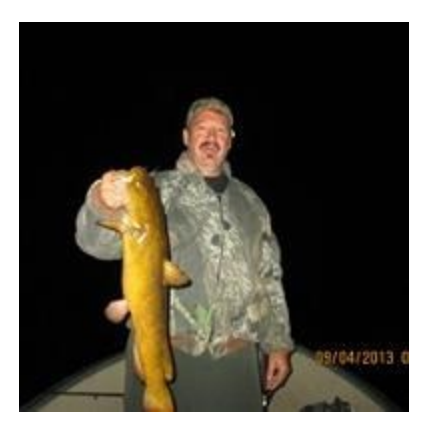
The Whitley's Catfish Fever