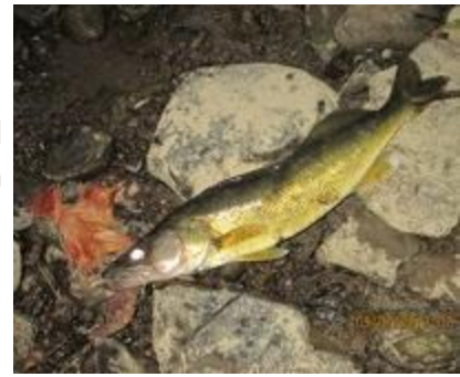
French Creek 'eye

Angler Al (Franklin) filed 9/9: "Back on September 1 when the air temp dropped due to the approaching storm, French Creek was looking good. So I grabbed my rod, lures and net, and beat it down to my favorite rock piles. Within 10 casts of working a #5 Shad Rap, I landed a nice 3-pound smallie. A few casts later, another smaller smallmouth smacked the plug. Then thunder and lightning rolled, so I called it an evening. On the evening of Saturday, September 7, I took to French Creek at dusk. On my first cast with a silver & black #5 Shad Rap, a 12" smallmouth smacked it. Later I switched to a Torpedo Bomber and for the first time in many years, I caught an 18" walleye on a topwater plug!" (See photo)