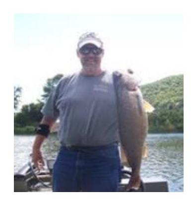
13 lb. drum