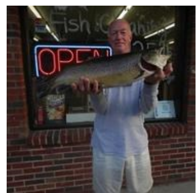
32" Brown

Ric Gauriloff (Trout Run Bait) filed 9/9: "Walleye and perch fishing still remains good when fishermen