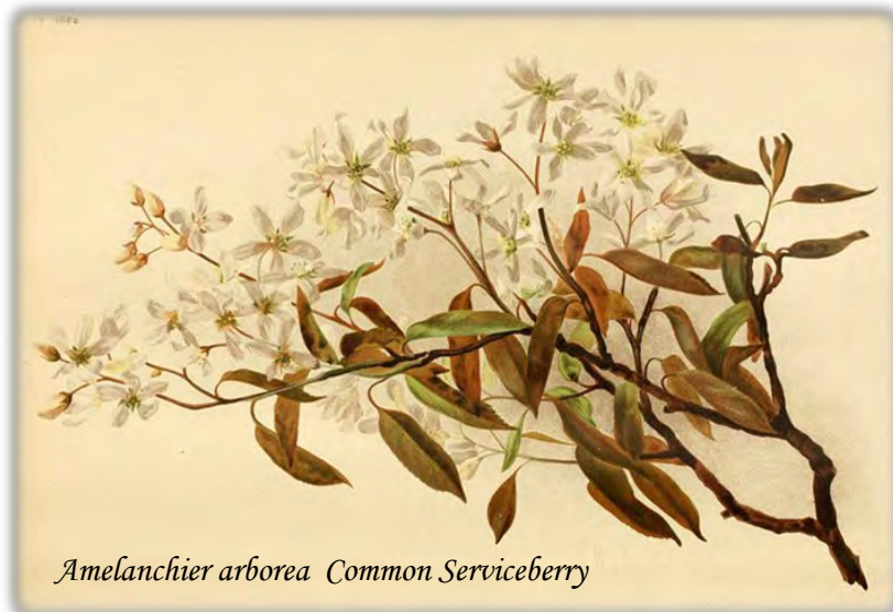
Amelanchier arborea Common Serviceberry